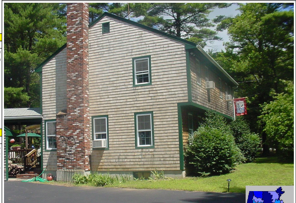
244 KINGS TOWN WAY