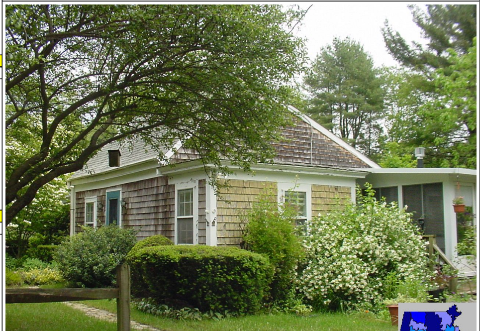
31 WINTER ST