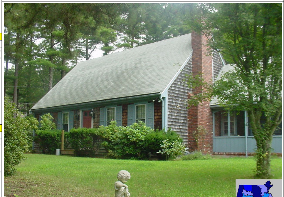
107 KINGS TOWN WAY