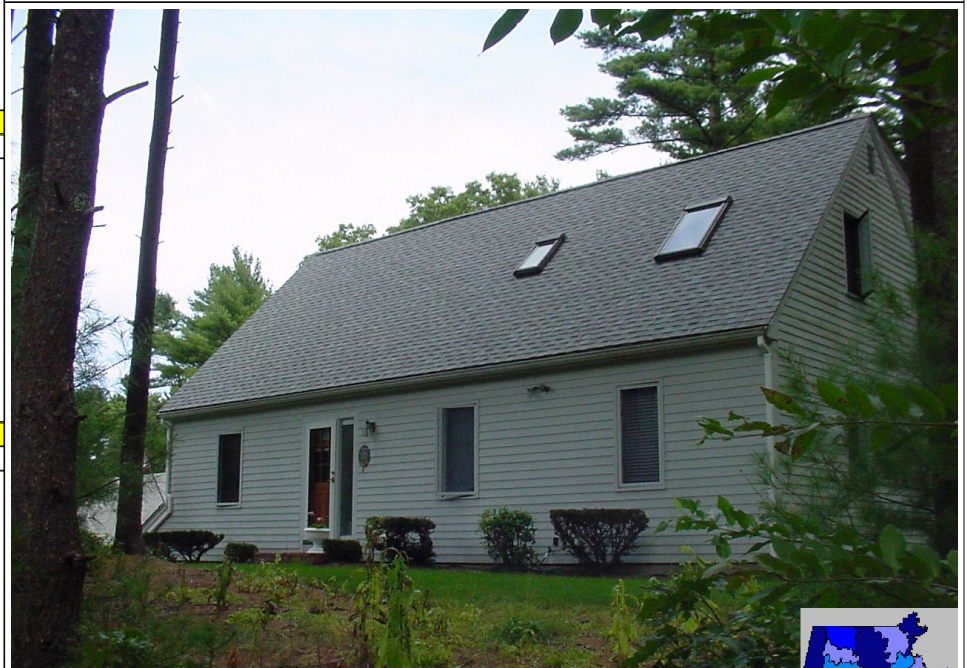
49 TROUT FARM LN