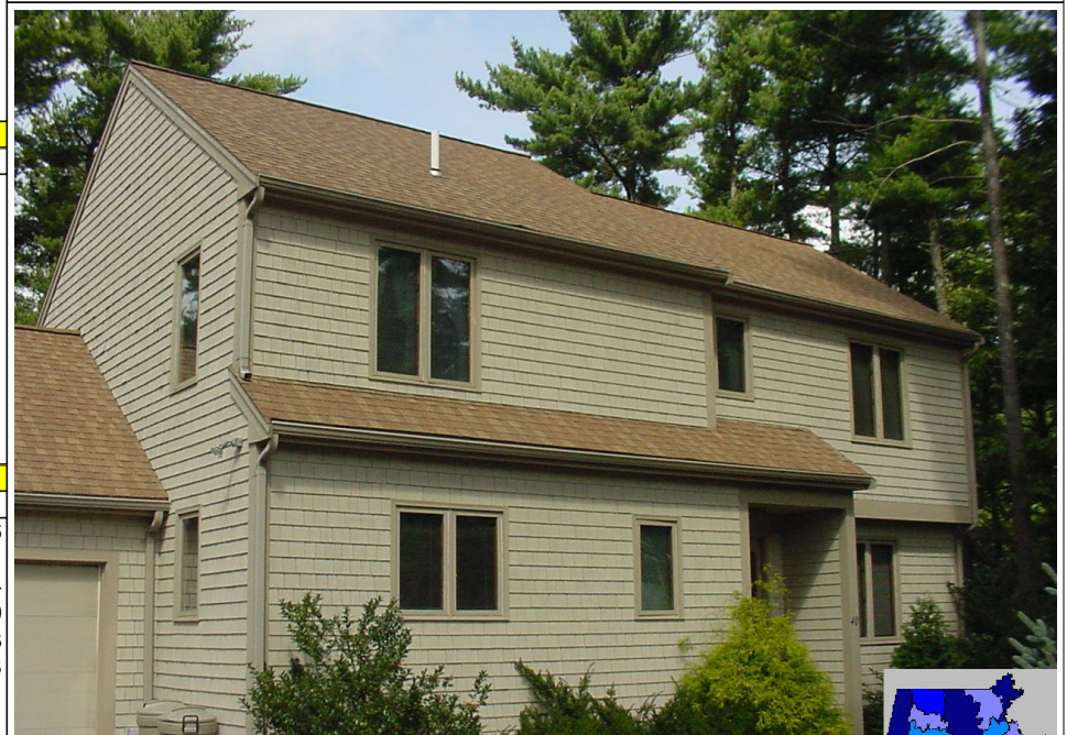
40 TROUT FARM LN