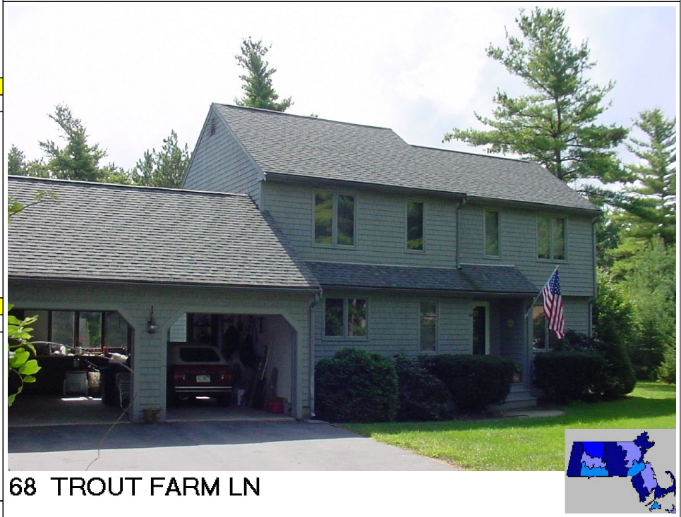
68 TROUT FARM LN