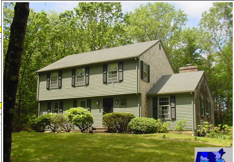
67 STOCKADE PATH