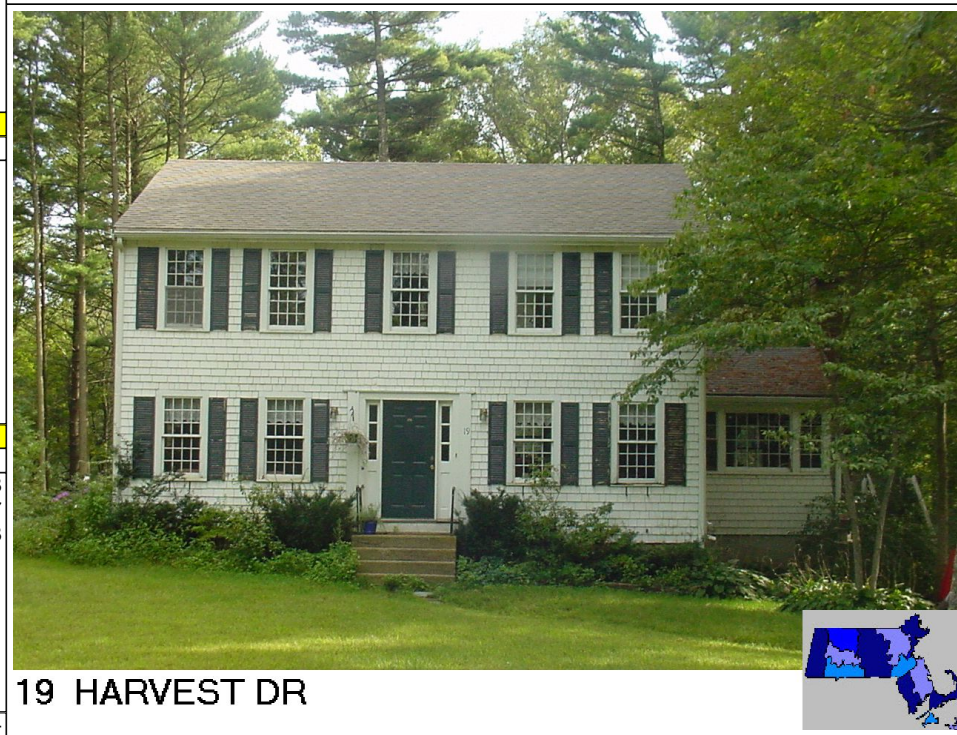
19 HARVEST DR