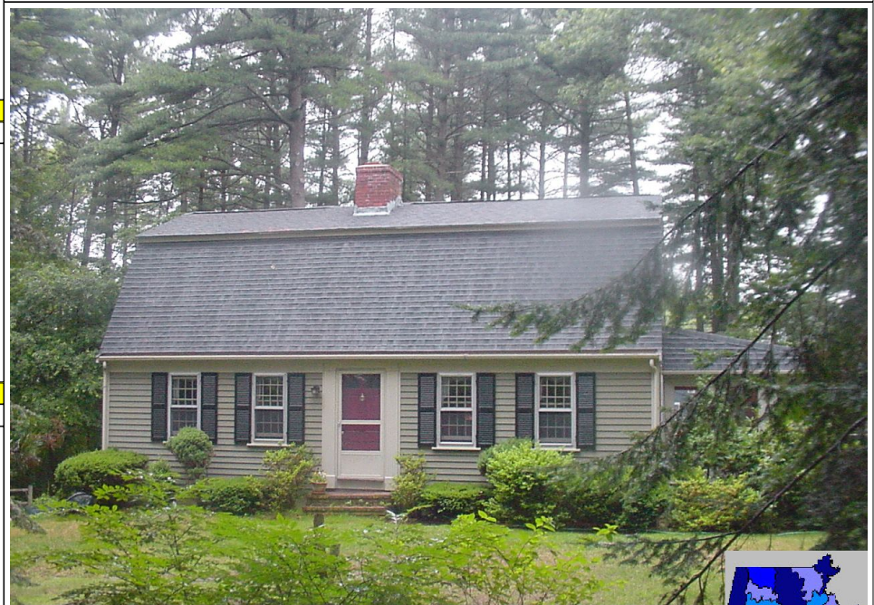
268 CHURCH ST