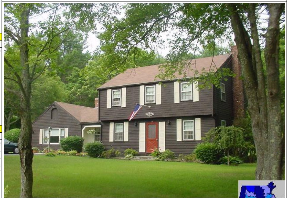
38 CARR RD