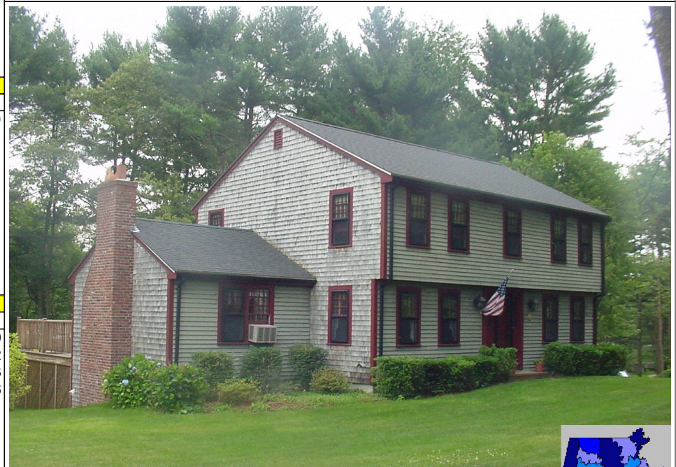
51 PARTING ROCK RD