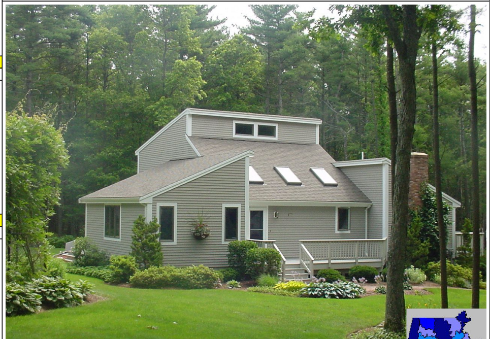
10 JEREMIAH DR