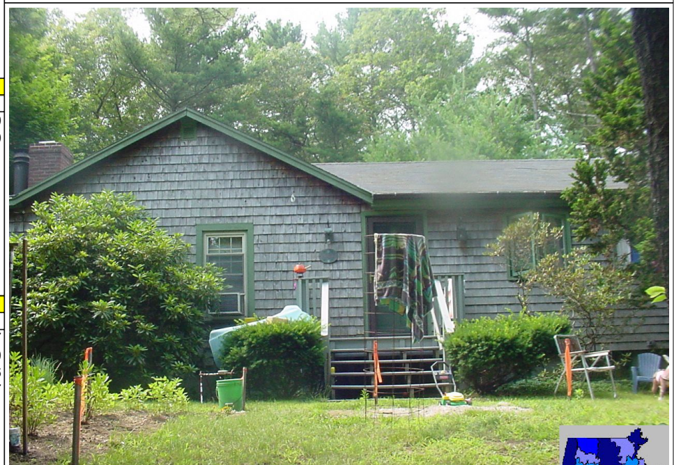
87 TEAKETTLE LN