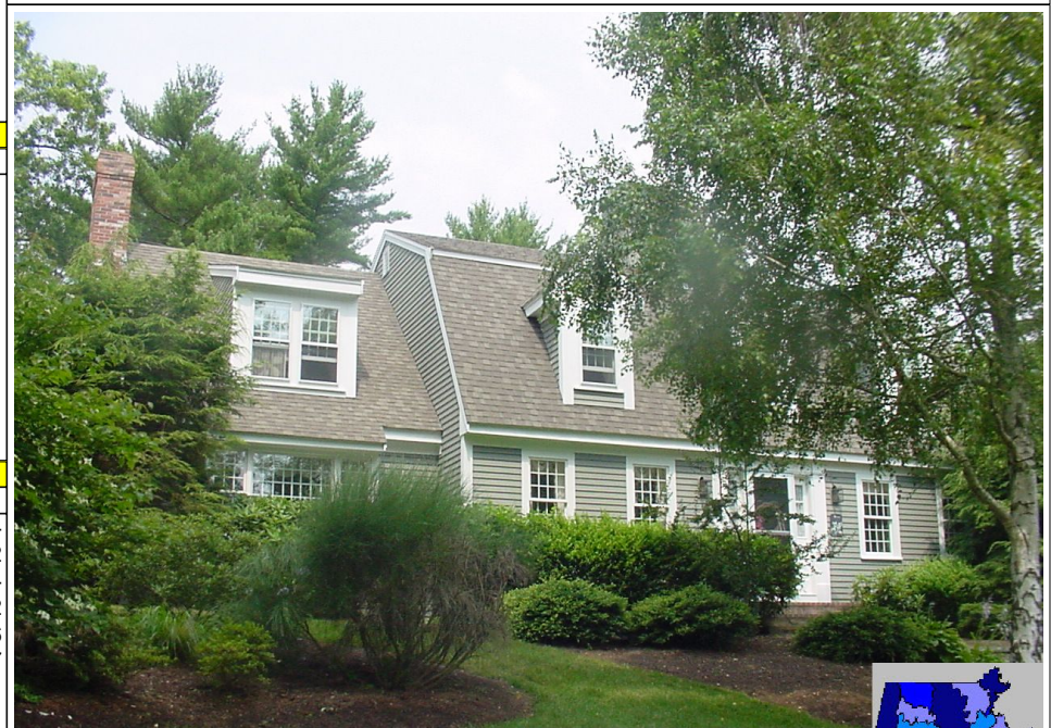
4 PHEASANT HILL LN