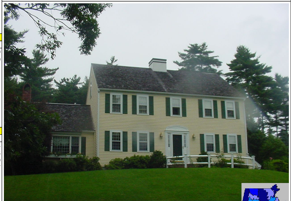
19 SIMMONS DR