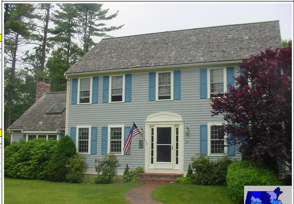
60 SIMMONS DR