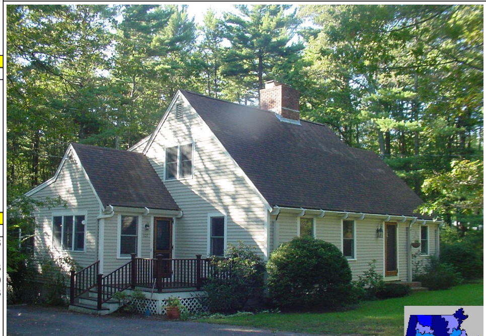
121 TOBEY GARDEN ST