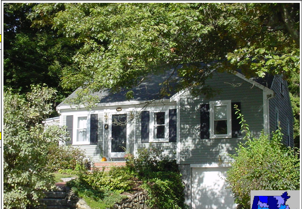
388 BAY RD