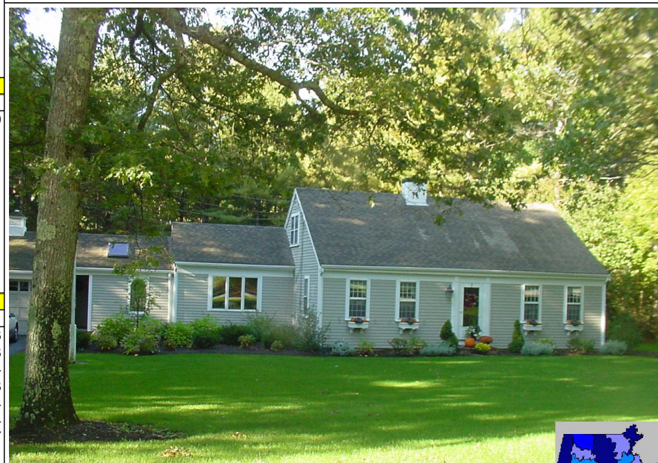
78 INDIAN TRL