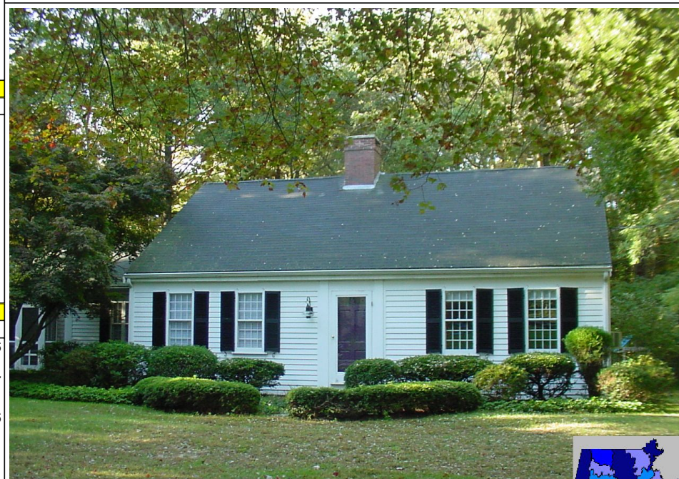
14 INDIAN TRL