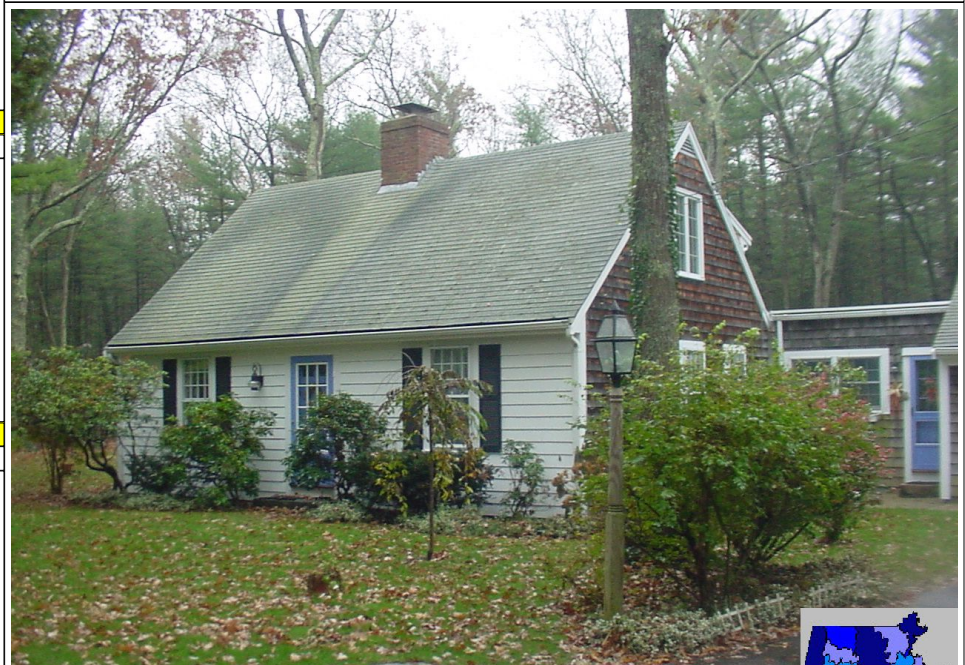
407 TREMONT ST