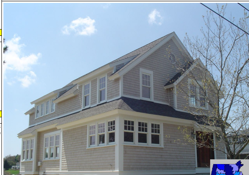
38 LANDING RD