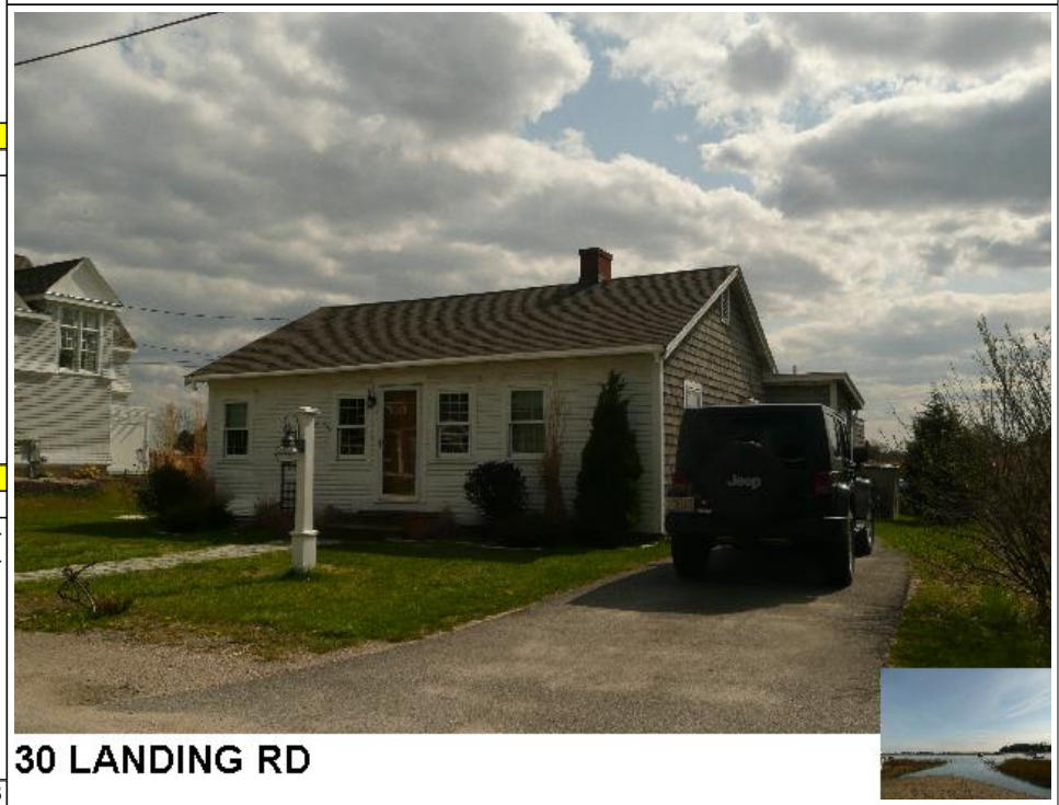
30 LANDING RD