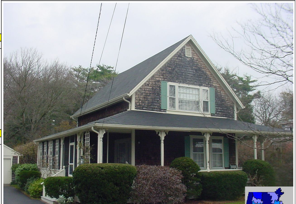
23 LANDING RD