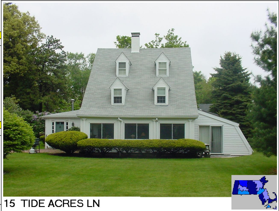
15 TIDE ACRES LN