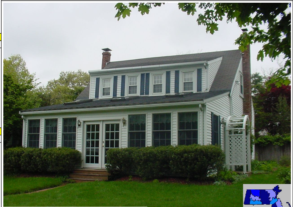
56 OLD COVE RD