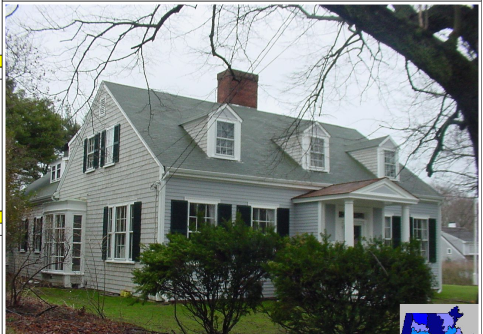
381 WASHINGTON ST