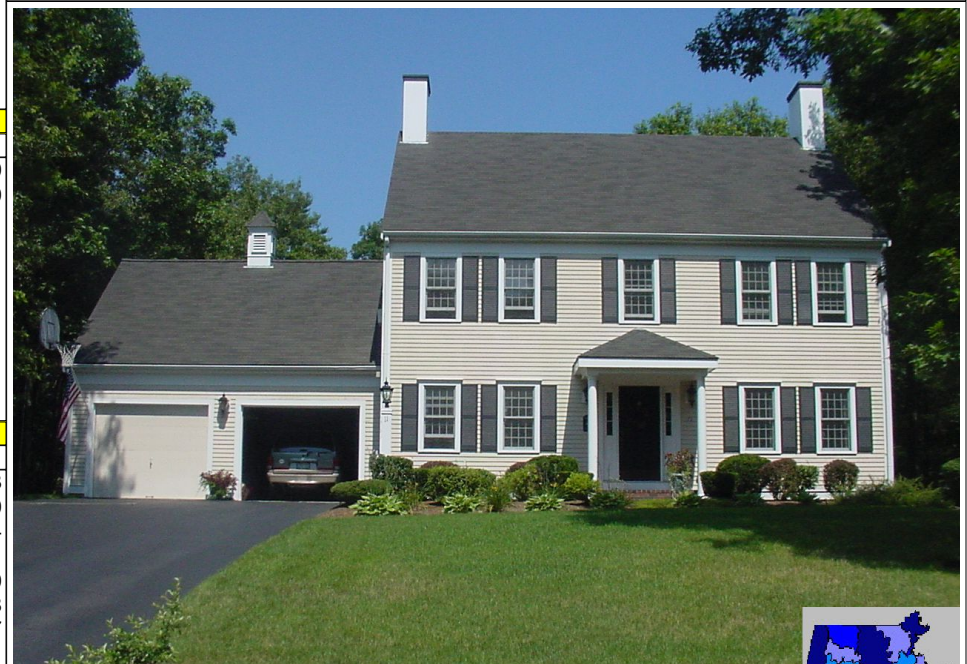
11 HUNT FARM DR