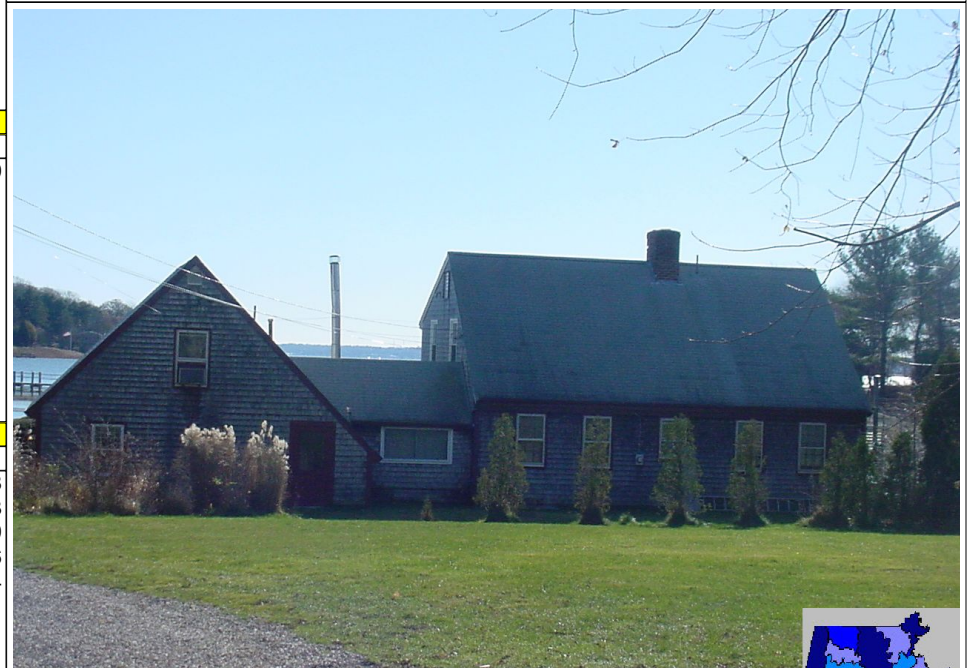
159 BAY RD