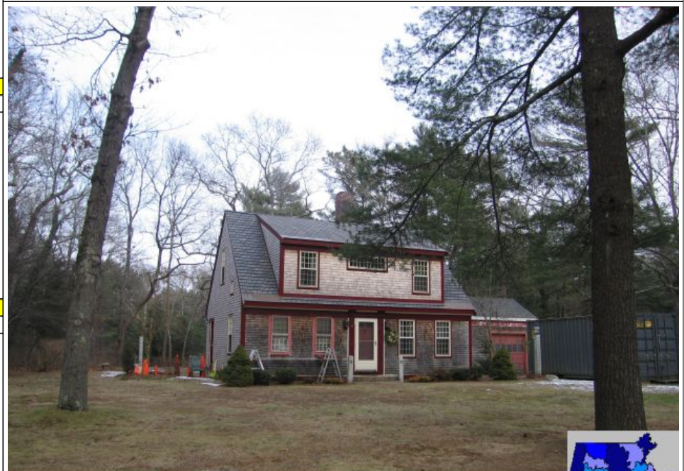
91 BAY VIEW RD