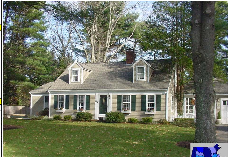
65 WADSWORTH RD