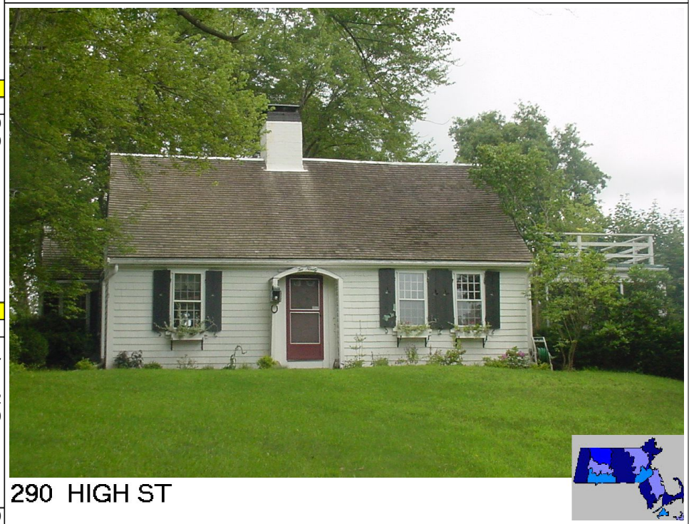
290 HIGH ST