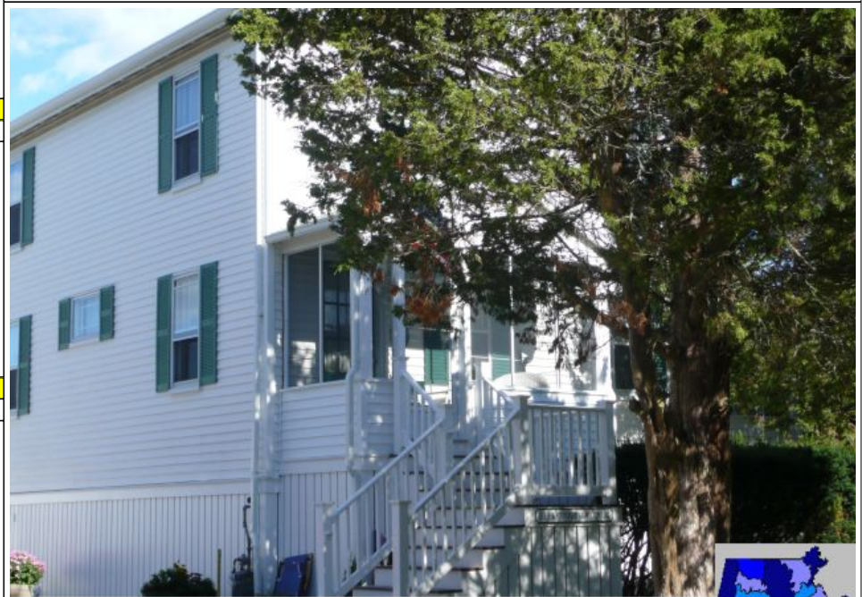
19 PLYMOUTH AVE