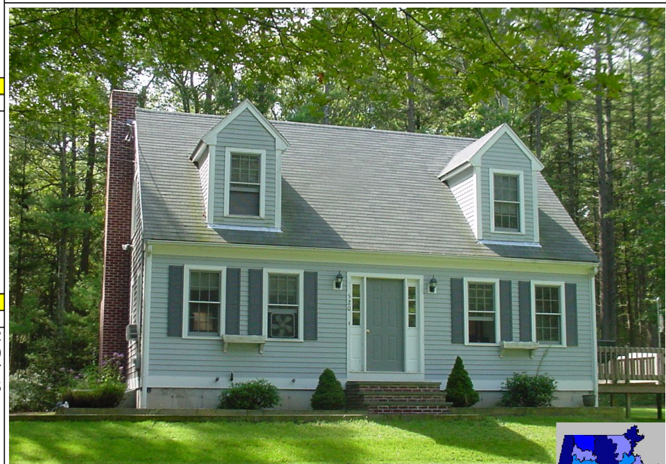
520 UNION BRIDGE RD