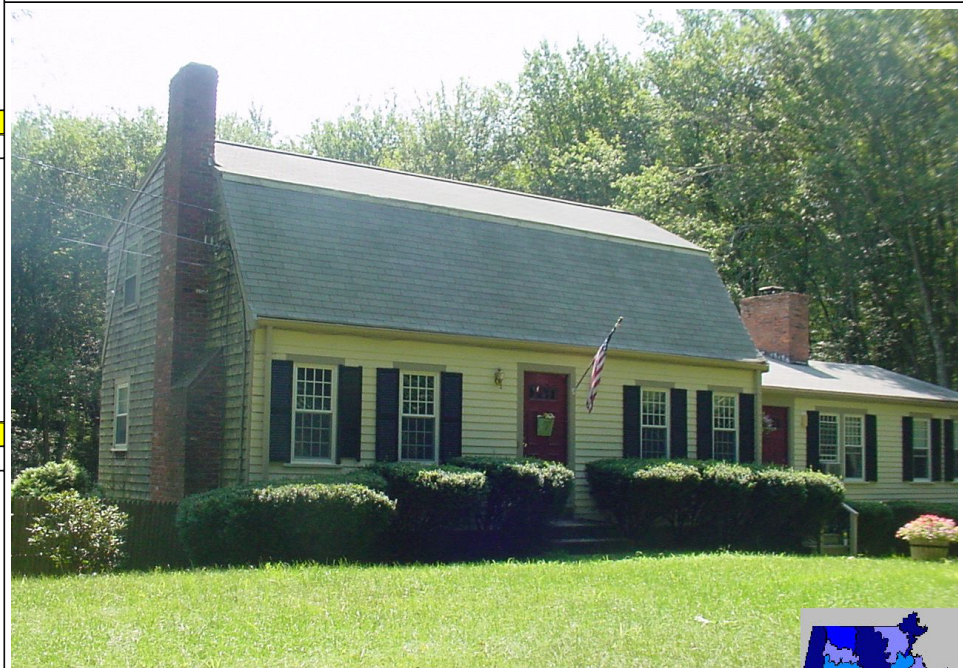
391 KEENE ST