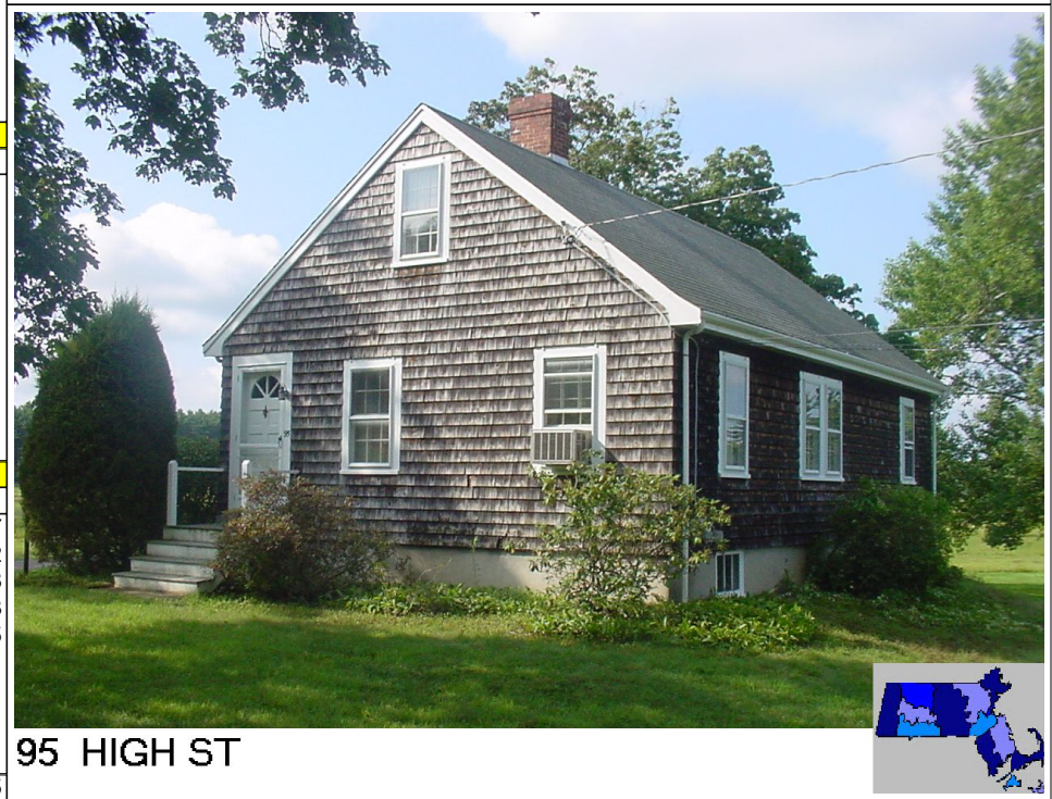
95 HIGH ST