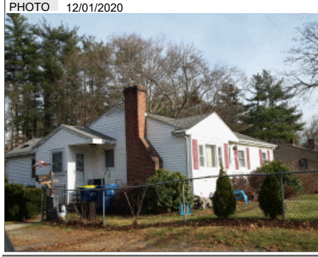
PHOTO 12/01/2020 BLDG COMMENTS