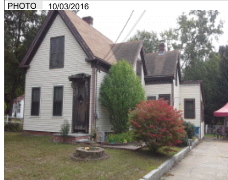
PHOTO 10/03/2016 BLDG COMMENTS