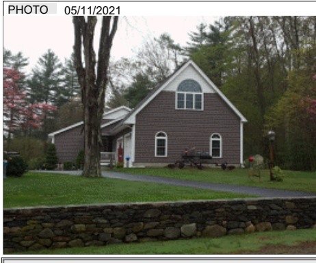
PHOTO 05/11/2021 BLDG COMMENTS