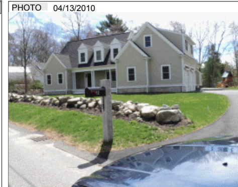
PHOTO 04/13/2010 BLDG COMMENTS 2 XTRA SHOWERS