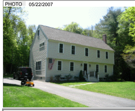
PHOTO 05/22/2007 BLDG COMMENTS FY12 FR-G TO AVE OUTSIDE SHOWER