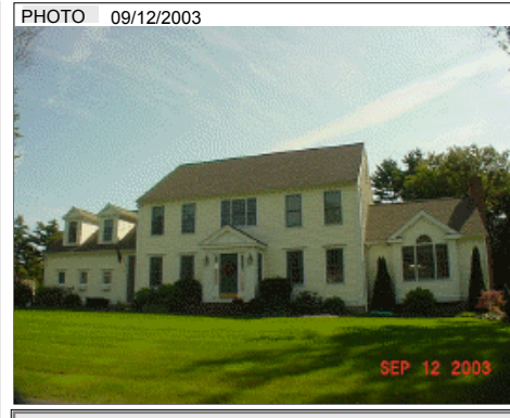
PHOTO 09/12/2003 BLDG COMMENTS FY12 QUALITY CHANGE FROM VG TO GD PER FIELD REVIEW.