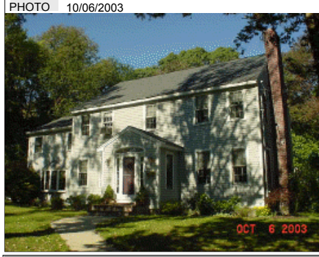
PHOTO 10/06/2003 BLDG COMMENTS FY19 + TO AVG, ADDED BMU, SKETCH CORR