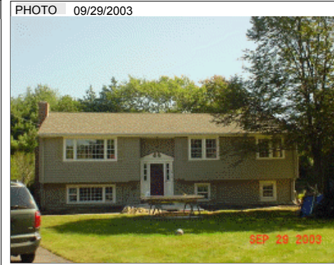
PHOTO 09/29/2003 BLDG COMMENTS FY12 FR-G TO AVE