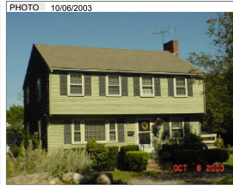
PHOTO 10/06/2003 BLDG COMMENTS FY12 FR-G TO AVE