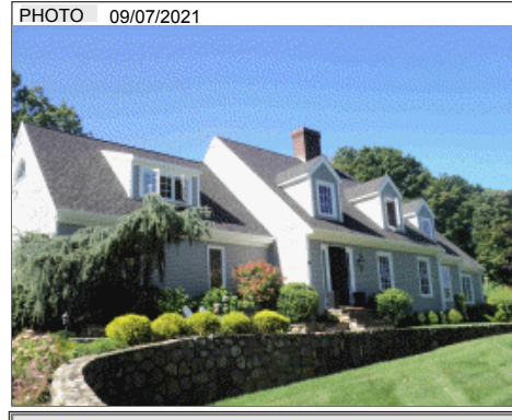
PHOTO 09/07/2021 BLDG COMMENTS