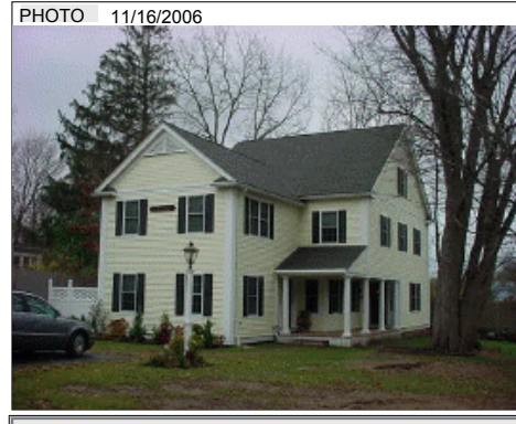
PHOTO 11/16/2006 BLDG COMMENTS