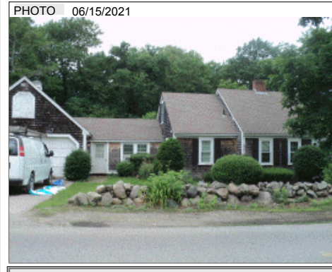
PHOTO 06/15/2021 BLDG COMMENTS MLS