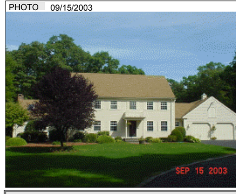
PHOTO 09/15/2003 BLDG COMMENTS FY12 QUALITY CHANGE FROM VG TO GD PER FIELD REVIEW.