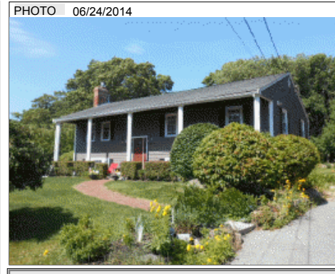
PHOTO 06/24/2014 BLDG COMMENTS